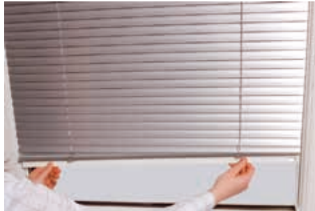
17. To align the bottomrail horizontally, simply pull it into the position desired. It will stay in position under tension from the cords.