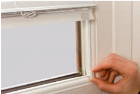
16. With cord at bottom of bracket, slide onto clip. Repeat both sides.