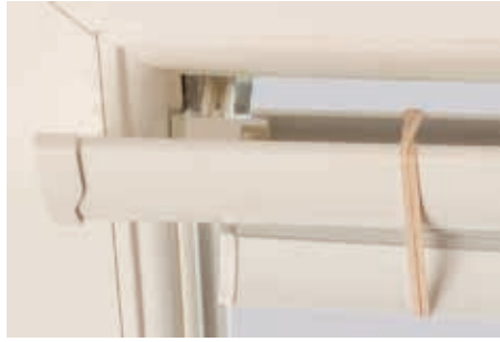
14. With rubber bands in place, align the headrail end cap slot with bracket arms.