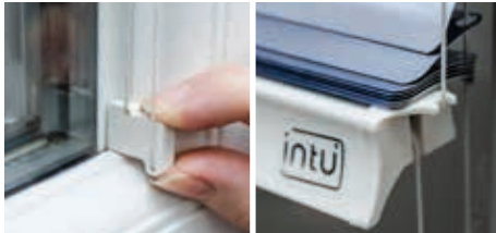
16. With cords at bottom of bracket, slide onto clip. Repeat both sides. Ensure the front cord sits within the notch of the bottombar endcap.

The steps required to fit INTU® Privacy blinds are the same as for INTU® Venetian up to step 15. From then on, follow the instructions below.