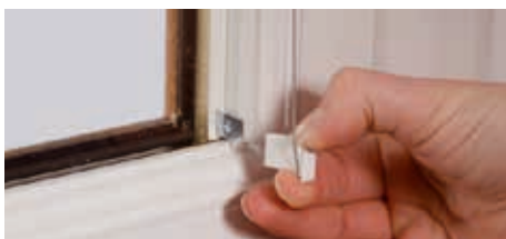
16. With cord at bottom of bracket, slide onto clip. Repeat both sides.

The steps required to fit INTU® Pleated or Duette® blinds are the same as for INTU® Venetian up to step 15. From then on, follow the instructions below.