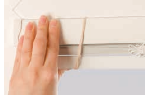
15. Ensure headrail is correctly aligned and firmly press home. Snip off rubber bands and lower the slats fully.