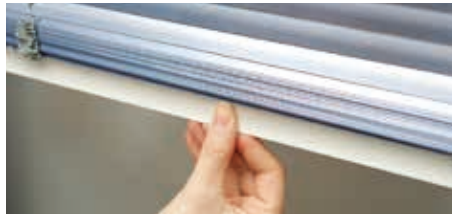
17. To align the bottomrail horizontally, simply pull it into the position desired. It will stay in position under tension from the cords.