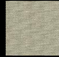
MOKA - 012