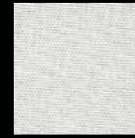
WHITE - 001