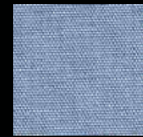
BLUE - 008