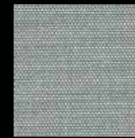
DARK GREY - 010