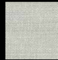
LIGHT GREY - 002