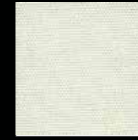
CREAM - 003