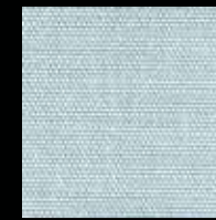
SKY - 014