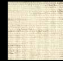
BEIGE - 004