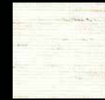
WHITE - 001