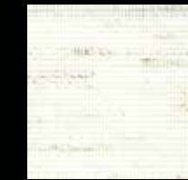
CREAM - 003