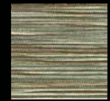
OLIVE TWIST- 008