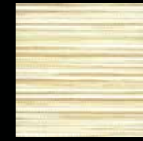
CAMEL - 003