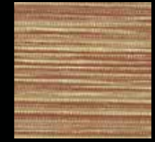
GOLDEN AMBER- 012