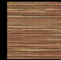
COFFEE - 002