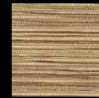
LIGHT OAK- 014