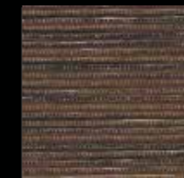
MAHOGANY - 010