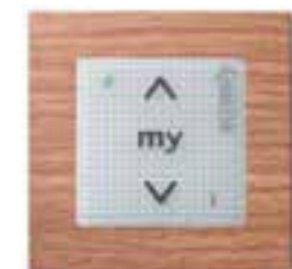
Smoove 1 RTS, single channel with up, down, stop and 'My' pre-set favourites.