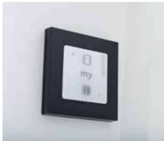
Smoove® battery operated wall switch