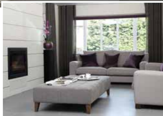
Relax... and enjoy the luxury of modern living.