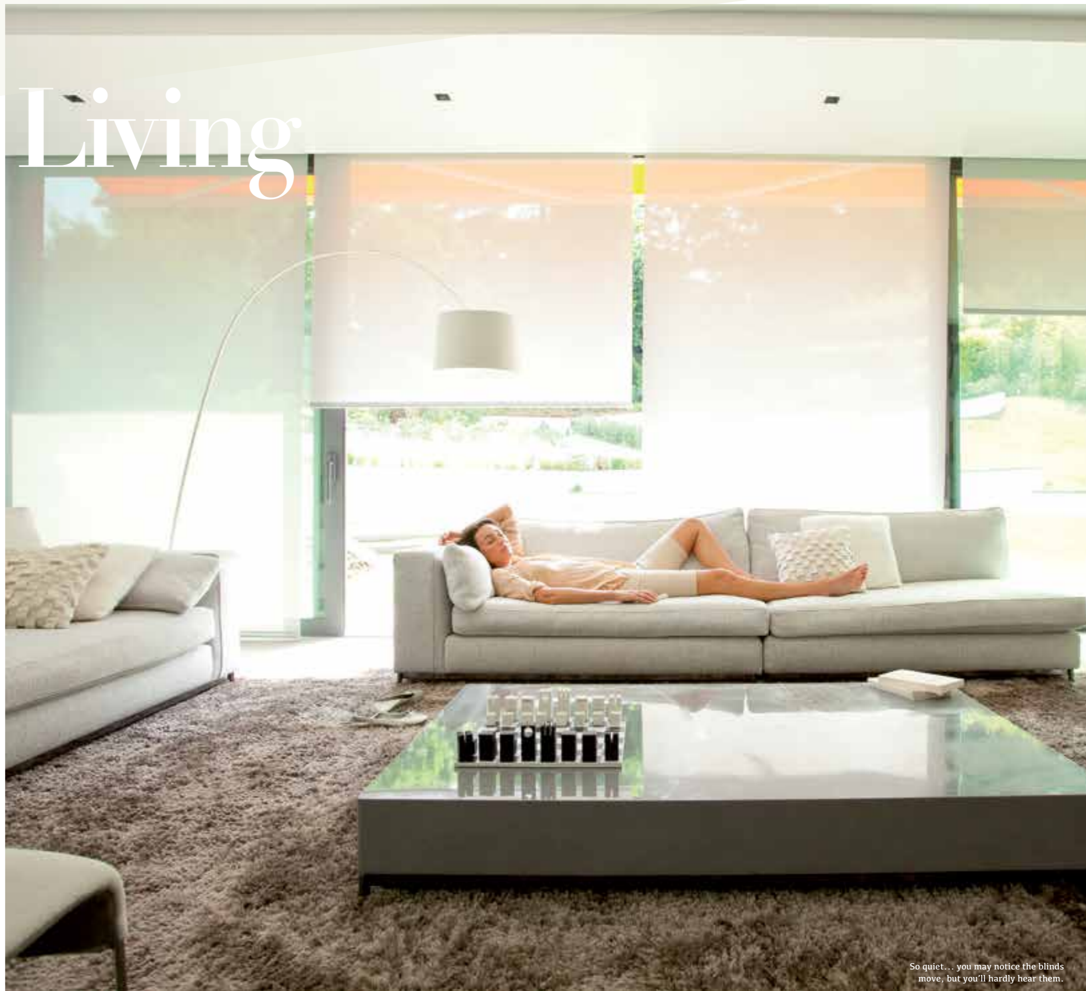
So quiet... you may notice the blinds move, but you'll hardly hear them.

Super quiet blinds won't disturb the peace at bedtime. You'll hardly hear them, so you can focus all your attention on your baby. They'll simply close quietly in the background, creating a peaceful ambience to lull your little one to sleep. Being motorised means there are no operating cords to endanger your child, giving you peace of mind.