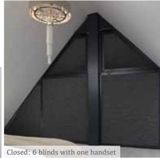
Closed: 6 blinds with one handset

Take advantage of the personal service offered by your Somfy® Expert and enjoy stunning made to measure, motorised blinds for years to come.