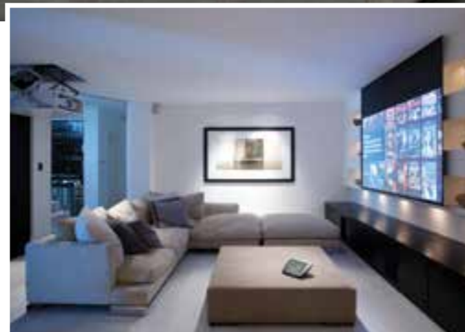
Integrate your Somfy® powered blinds with your existing home automation system.

Home automation is all around you, effortlessly working for you, anticipating your needs. We've all grown up with TV remote control and now it's reached even greater heights. It's all you need to transform your living room into a stylish and comfortable entertainment space.