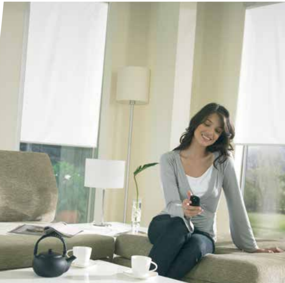
'Lifestyle scenarios' set your blinds to give the ambience for watching TV, reading or working.