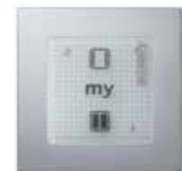
Smoove 1 Open/Close RTS, with open, close, stop and 'My' pre-set favourites.