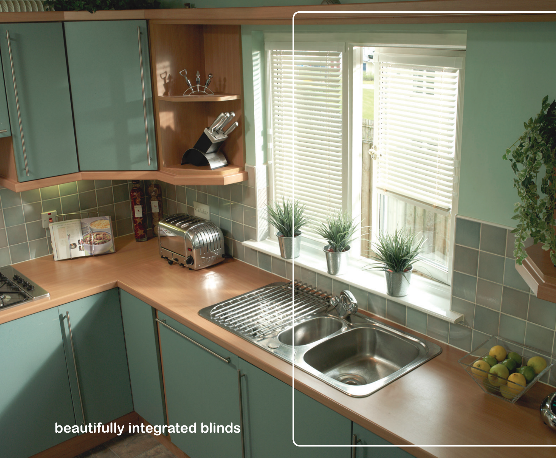
beautifully integrated blinds