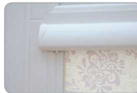
Unique INTU® roller fascia

The unique design of the INTU® Roller low profile fascia gives a sleek, modern appearance, taking the popular roller blind to a new level.