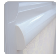
INTU® discreet fascia

The streamlined bottomrail gives perfect control. Easily locking into position at any point, INTU® Roller also provides outstanding energy efficiency and room darkening options with blockout, solar reflective and fire retardant fabrics. The INTU® Roller is particularly 'child safe' eliminating all hanging cord loops or chains.