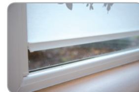
INTU® streamlined bottom bar